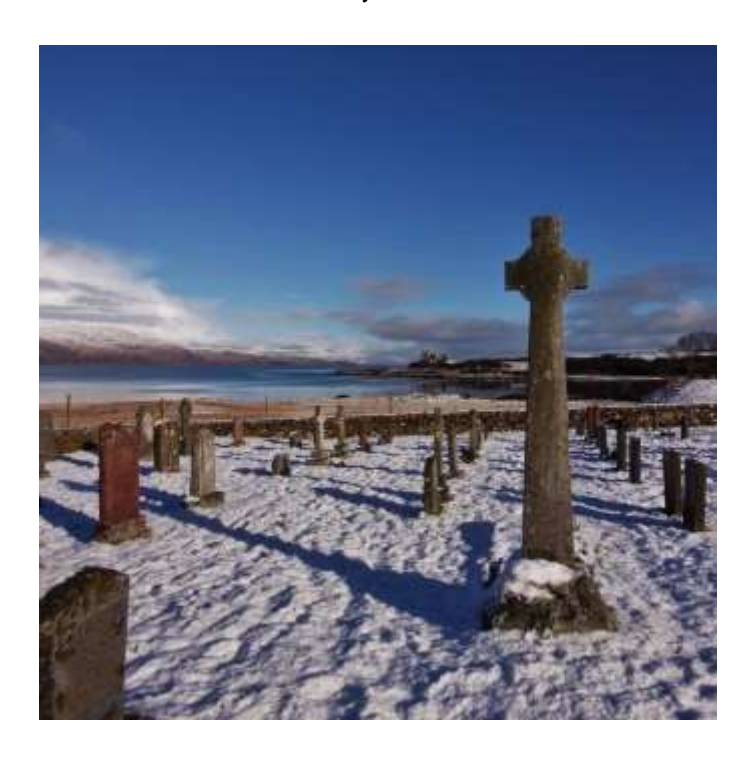
Psalms Continued (always)

Last week I wrote of two things, which I'll stop short of calling promises. Maybe they are better called hopes. I hoped to get back to writing weekly. "This week should be an easy time to do that," I thought. On Monday I got one phone call and one e-mail, both of which changed my plans for the next few months. The e-mail said that an organ recital I was to play in May, one I've been practicing hard for, has been canceled, or at least postponed. The phone call came as a surprise in many ways. I was asked to play another recital, this one at Reid Memorial Presbyterian Church in Augusta. I'll explain the significance of that later. I immediately said "yes" (a risky thing to do), but that was in answer to "would you be interested in playing a recital here." Then I asked when. "How about April?" As in April, 2023? No, they meant April 2022, as in two months from now. That called for a significant change in the music I've been practicing, so I got to work.