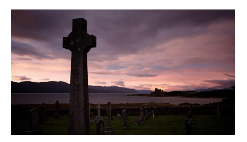
It's a small world

I've said before, every year we think once Christmas is behind us, things will slow down in January and get easier. Yet that never seems to really happen. I haven't written in a while because I've had some other things calling for my time and energy.